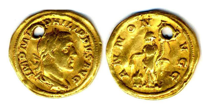
Aureus, 244-247, 4,20g, 21mm, Die-axis: 0h Cabinet des Médailles, Paris, Rothschild 463