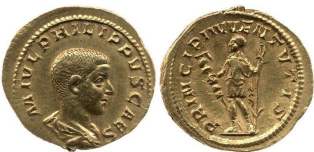
Aureus, 244-246, 4.51 g, Die-axis: 6h British Museum, Reg. No: R1874,0715.97 Purchased from Rollin & Feuardent in 1874

Philip II, in military dress, standing front, head left, holding standard sloped to left in right hand and vertical spear, point downwards, in left RIC 220a, C.60, Calicó 3277