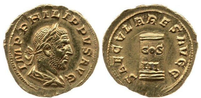
Aureus, 248-249, 4.68g, Die-axis: 12h British Museum, Reg. No: 1896,0608.58 Purchased from Rollin & Feuardent in 1896, previous owner/ex-collection Hyman Montagu