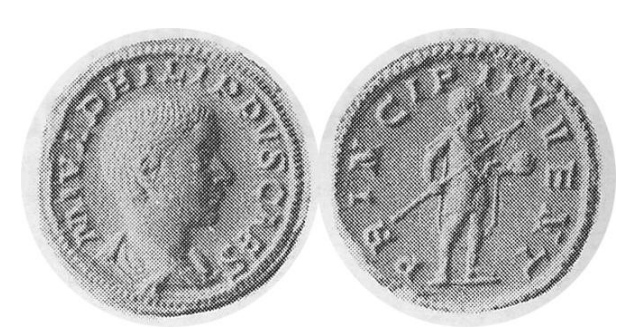
Aureus, 244-246, weight unknown, from Auction on 16<sup>th</sup> December 1913, Lot 509, published in [8] As we do not have a weight of this aureus, we cannot say that it is not one of the 7 aurei from the list without photos, namely Id. 102, 103, 106, 106, 109, 110, 112. Unless we get a weight of this coin, we cannot allocate the photo to already existing coin, or claim it is a new one.