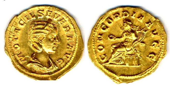
Aureus, 246-248, 4,20g, 21mm, Die-axis: 0h Cabinet des Médailles, Paris, Beistegui 151