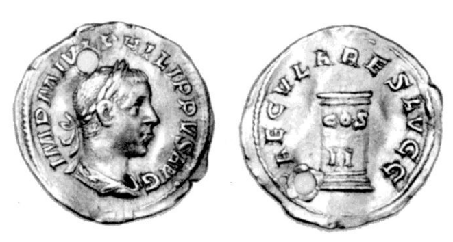
Aureus, 248, 4,18g, pierced Cabinet des Médailles, Ex coll. Rothschild 468