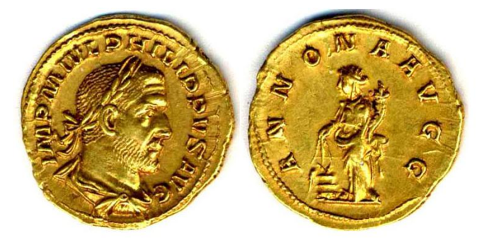
Aureus, 244-247, 4,74g, 19mm, Die-axis: 6h Cabinet des Médailles, Paris, FG1289