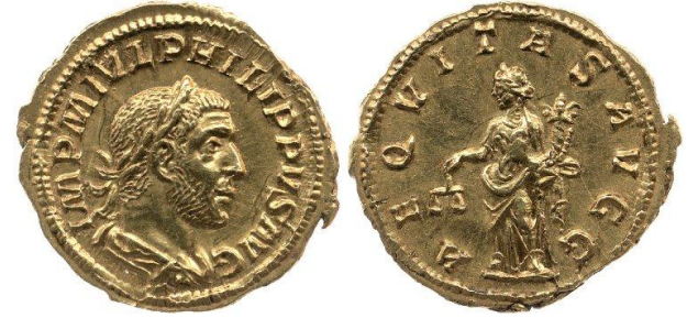
Aureus, 244-247, 4.31g, Die-axis: 6h British Museum, Reg. No: 1896,0608.57 Purchased from Rollin & Feuardent in 1896, previous owner/ex-collection Hyman Montagu

RIC 27a, C.7 but with AVG in averse, Calicó 3245