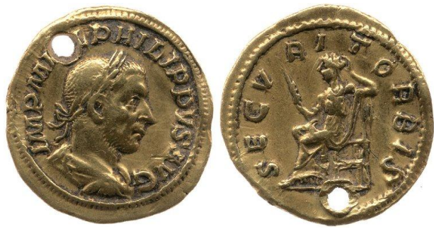
Aureus, 244-247, 4.01g, Die-axis: 7h British Museum, Reg. No: 1867,0101.797 Purchased from Louis, Duc de Blacas d'Aulps in 1867. Previous owner/ex-collection Pierre, Duc de Blacas d'Aulps