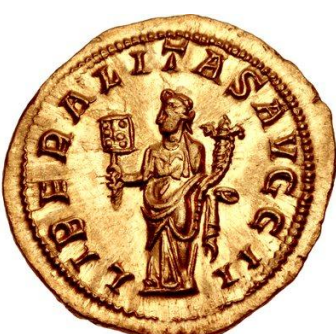
Aureus, 244-247, 4,65g, 21mm, 12h Auction CNG Triton XVI (9.1.2013), Lot 1122