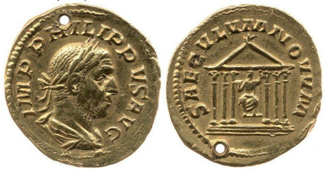
Aureus, 248-249, 4.51g, Die-axis: 6h British Museum, Reg. 1896,0608.59 Purchased from Rollin & Feuardent in 1896, previous owner/ex-collection Hyman Montagu