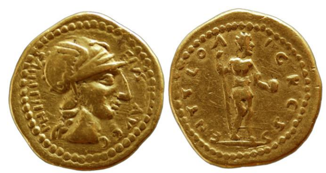
Barbarous medal, Antioch, Syria 244-249, 10,66g, 23,7mm, Die-axis: 5h Vienna Münzkabinett, RÖ 32.227