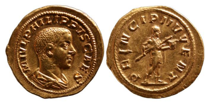
Aureus, 244-246, 4,83g, 21,3mm, 7h Vienna Münzkabinett, RÖ 18.166