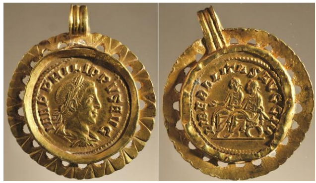
Unique aureus in a pendant, 7,61 grams of total weight, 12 hours, fake? Musei Capitolini, Rome, No. 4546