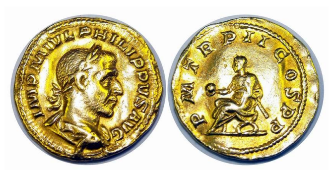
Aureus, 245, 21 mm, Die-axis: 0h, 4.72g, Hunterian Coll.: Catalogue no. 29697