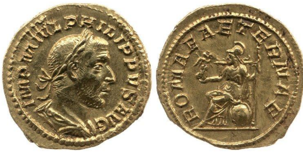
Aureus, 244-247, 4.46g, Die-axis: 1h British Museum, Reg. No: 1867,0101.796 Purchased from Louis, Duc de Blacas d'Aulps in 1867. Previous owner/ex-collection Pierre, Duc de Blacas d'Aulps.