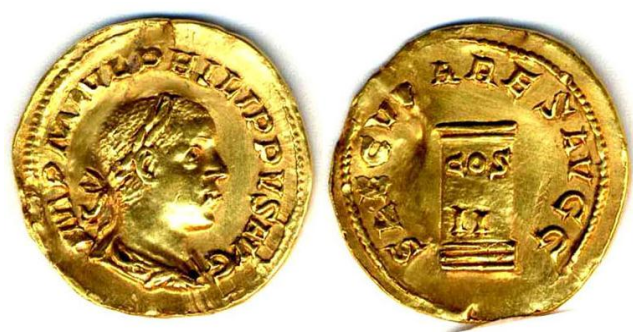
Aureus, 248, 4,70g, 20mm, Die-axis: 6h Cabinet des Médailles, Paris, FG1300