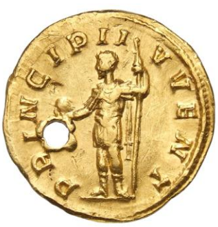
Aureus, 244-246, 4,55g, 20mm, Die-axis: 6h Berlin Münzkabinett, Object no. 18203384, Accession 1855/17531