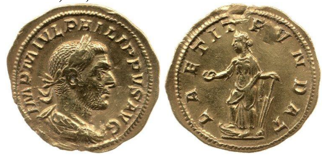
Aureus, 244-247, 4.79g, Die-axis: 6h British Museum, Reg. No: R1874,0715.95 Purchased from Rollin & Feuardent in 1874