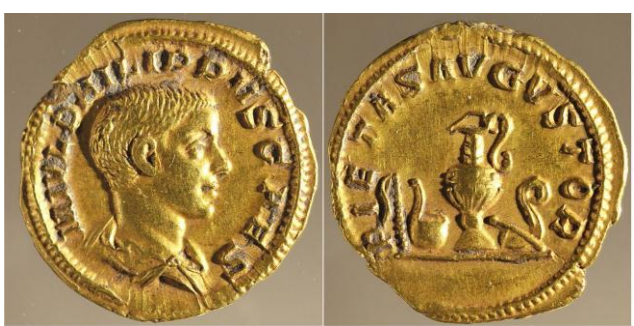
Aureus, 244-246, 4,00g, 21mm, Die-axis: 6h Musei Capitolini, Rome, No. 4547, fake?