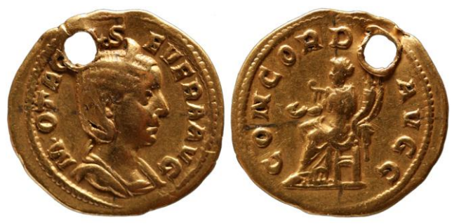
Aureus, 246-248, 4,74g, 20,6mm, 12h, pierced, Vienna Münzkabinett, RÖ 18.084