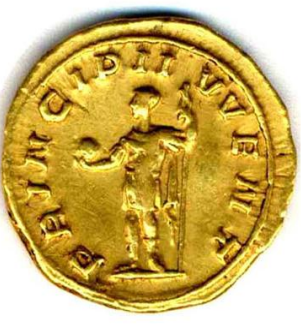
Aureus, 244-246, 4,86g, 20mm, Die-axis: 11h Cabinet des Médailles, Paris, FG1298