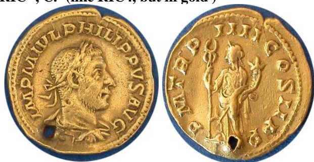
Aureus, 247, 20mm, 4,25g, Die-axis: 11h The Royal Coll. of Coins and Medals, Copenhagen, No. R38A, Purchased from Rollin in Paris (probably mid 19th century, exact date unknown)