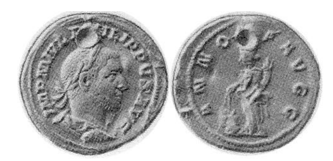
Aureus, 244-247, 4,75g, pierced, Collection Franz Trau, 1935, Lot. 2696