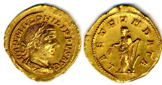
Aureus, 244-247, 4,25g, 20mm, Die-axis: 6h Cabinet des Médailles, Paris, FG1290

Laetitia standing left holding wreath and rudder RIC 35a, C.71, Calicó 3249