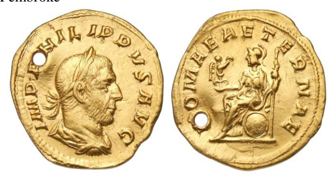
Aureus, 247-249, 4,53g, 20mm, 6h Berlin Münzkabinett, Object no. 18220967 Accession 1856/18152