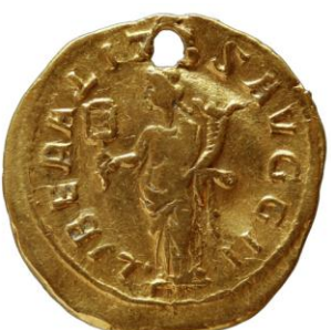
Aureus, 244-247, 4,33g, 20,4mm, 12h, pierced, Vienna Münzkabinett, RÖ 17.835