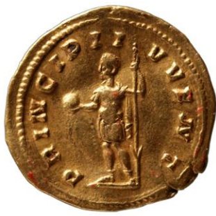
Aureus, 244-246, 4,6g, 20,9mm, 7h Vienna Münzkabinett, RÖ 36.992, from Bachofen Collection No. 2025