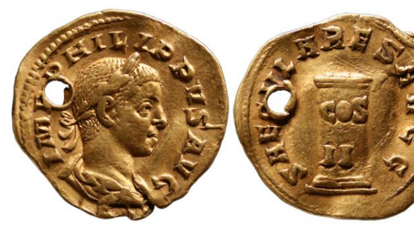
Aureus, 248-249, 4,11g, 20,7mm, 5 hours Vienna Münzkabinett, RÖ 70.243, from Franz Trau Collection No. 2752, auctioned in 1935.

Chronicle in 1939, page 25. Aureus of this reverse legend is documented here for the first time thanks to Thibaut Marchal, who very kindly provided the picture and details of the coin.