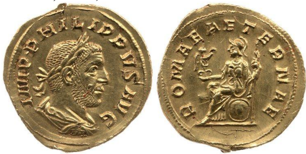
Aureus, 247-249, 4.46g, Die-axis: 7h British Museum, Reg. No: 1848,0819.95 Purchased through Sotheby's in 1848, Previous owner/ex-collection Thomas Herbert, 8th Earl of Pembroke