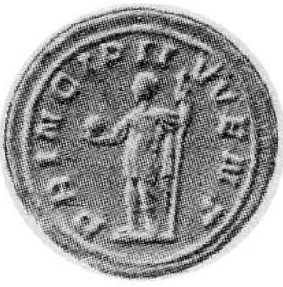
Aureus, 244-246, 4.85g, Collection Franz Trau, Auction 1935, Lot 2751. This could be a new aureus into the list, but it could also be the same coin as id. 134: 4.84grams, MMAG 1/7/1955, Lot 826 and there is no way to distinguish between them without MMAG catalogue photo available.