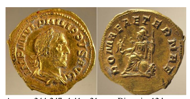
Aureus, 244-247, 4.41g, 21 mm, Die-axis: 12 h Musei Capitolini, Rome, No. 4473