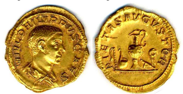
Aureus, 244-246, 3,90g, 20mm, Die-axis: 7h Cabinet des Médailles, Paris, Rothschild 466