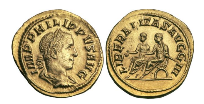
Aureus, 247-249, 4,71g Heritage World Coin Auctions, 2 January 2012 New York Signature Sale 3016, Lot 23176 Price realized: 40250 USD