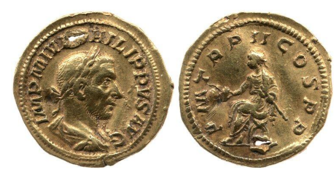
Aureus, 245, 4.63g, Die-axis: 7h British Museum, Reg. No: B.10298 Bequeathed by Clayton Mordaunt Cracherode in 1799