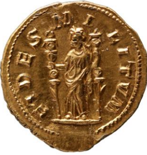
Aureus, 244-246, 4.46g, 20,6mm, 12 hours Vienna Münzkabinett, Reg. No: RÖ 17.856