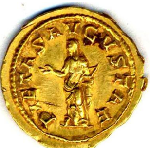
Aureus, 248-249, 4,41g, 20mm, Die-axis: 6h Cabinet des Médailles, Paris, Rothschild 465