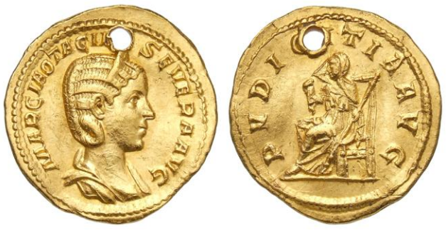
Aureus, 244-246, 4.98g, 20 mm, Die-axis: 12h Berlin Münzkabinett, Object no. 18202535, Accession 1861 Friedländer