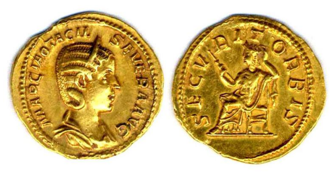
Aureus, 244-246, 4,40g, 20mm, Die-axis: 6h Cabinet des Médailles, Paris, FG1296