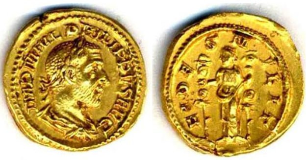
Quinarius, 244-247, 2,99g, 14mm, Die-axis: 6h Cabinet des Médailles, Paris, Z2237