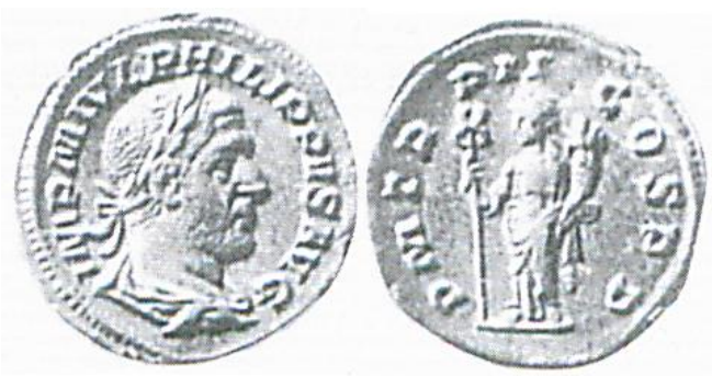
Aureus, 246, 4.78 grams, Auction Ciani-Vinchon, 6-7<sup>th</sup> May 1955, Lot 387 as published in Calicó 3254a. This coin seems to be the same as the following coin auctioned in 1910, holes are not repaired.