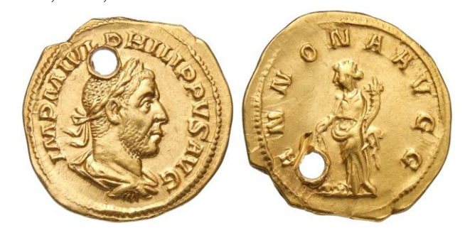
Aureus, 244-247, 4,52g, 20 mm, 6 h Berlin Münzkabinett, Object no. 18220966 Accession 1848/8561