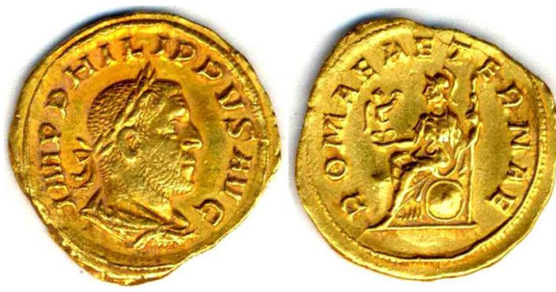
Aureus, 247-249, 4,80g, 21mm, Die-axis: 6h Cabinet des Médailles, Paris, FG1294