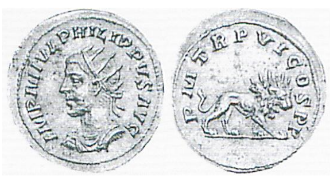
Aureus, Antiochia, 249, 7,10 grams Auction Numismatic Fine Arts (Rosemont), 14<sup>th</sup> August 1991, Lot. 287

RIC 238v, but in gold, C.-, Calicó 3274a