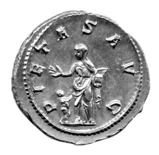
Aureus, 244-246, 7,2g, 21,8mm, Die-axis: 0h, Belgrade National Museum Coin Collection, Reg. No: NM Bel RCW 105/14, Published at B.Borić Brešković, in Antički portret u Jugoslaviji, Beograd 1987, 230, no. 215; B.Borić Brešković, in Antike Porträts aus Jugoslawien, Frankfurt am Main 1988, 186-187, cat. 215.