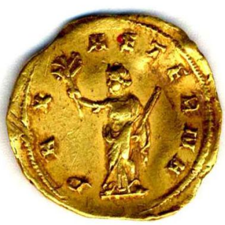
Aureus, 246-248, 4,93g, 20mm, Die-axis: 6h Cabinet des Médailles, Paris, FG1297