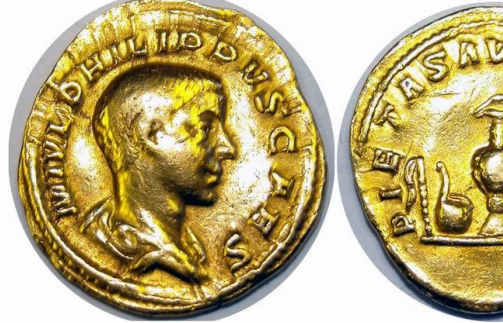
Aureus, 244-246, 21 mm, Die-axis: 12 o'clock 4.34g, Hunterian Coll.: Catalogue no. 29856

Sprinkler, simpuluvm, jug, knife and lituus RIC -, C.-, Like RIC 215 (but in gold), probably Calicó 3274