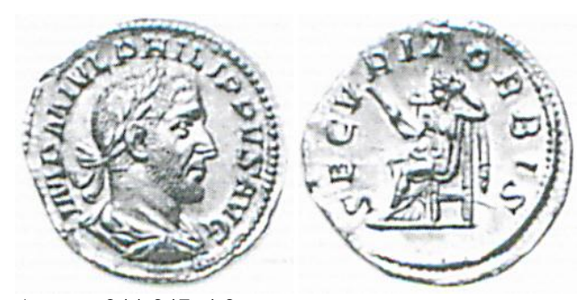
Aureus, 244-247, 4.2 grams Auction Naville 16 (1933), Lot 1994