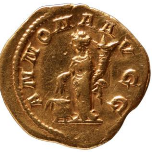
Aureus, 244-247, 4,21g, 21mm, 12 hours Vienna Münzkabinett, RÖ 37.691, from Bachofen Collection No. 1990