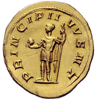
Aureus, 244-246, 4,47g, Die-axis: 12h NAC Auction 67 (17 October 2012), Lot 199 Price realized 15000 CHF, (~16159 USD) Ex Bruder Egger sale 28 November 1904, Prowe, 2668 and HAS 22103