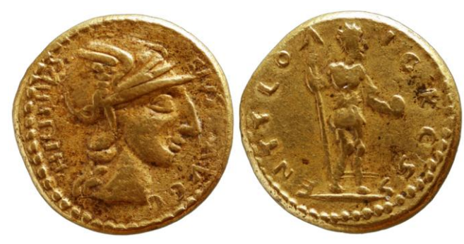
Barbarous medal, Antioch, Syria 244-249, 10,96g, 20,2mm, Die-axis: 5h Vienna Münzkabinett, RÖ 32.228