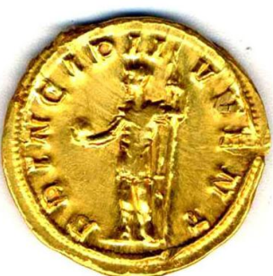
Aureus, 244-246, 4,78g, 20mm, Die-axis: 0h Cabinet des Médailles, Paris, Beistegui 150