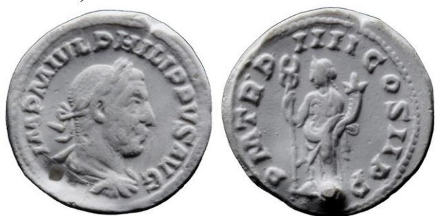
Aureus, 247, 4,26g, pierced This plaster cast from Vienna Münzkabinett looks like a cast of the previous coin from Copenhagen with holes located at the same places, and I consider this to be one and the same coin.