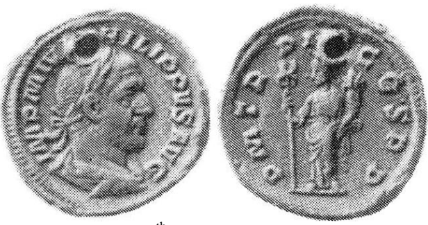
Aureus, Auction 5<sup>th</sup> December 1910, Lot 259, weight unknown, published in [8].