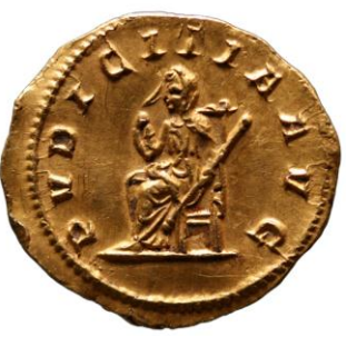
Aureus, 244-246, 4,59g, 20,8mm, 1h Vienna Münzkabinett, RÖ 18.102