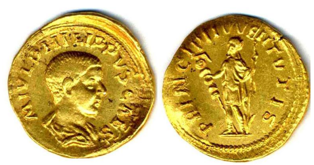
Aureus, 244-246, 4,94g, 21mm, Die-axis: 0h Cabinet des Médailles, Paris, FG1299