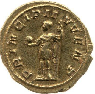
Aureus, 244-246, 4.89 g, Die-axis: 12h British Museum, Reg. No: R.81 Bequeathed by Clayton Mordaunt Cracherode in 1799