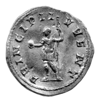
Aureus, 244-246, 4,41g, 20,6mm, Die-axis: 12h, Belgrade National Museum Coin Collection, Reg. No: NM Bel II/154, Publicised at B.Borić Brešković, Katalog sistematske zbirke rimskog carskog novca u Narodnom muzeju u Beogradu XVI, Numizmatičar 26-27, 2008, kat. 2456.