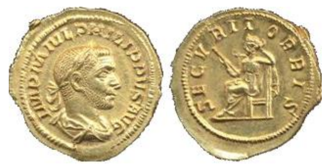
Aureus, 244-247, 22 mm, Die-axis: 0h 4.39g, Hunterian Coll.: Catalogue no. 29708