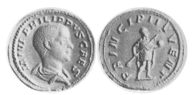
Aureus, 244-246, 4.76g, from Auction on 14 June 1978, Lot 220, published in [8]. This aureus has a weight given and by comparing images, it is clear that it is not id. 111 with similar weight 4,7grams. However, we have no idea, if it is a new aureus, or an aureus already in the list id. 109, 110, or 112 with very similar weights and no images available.