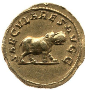
Aureus, 248, 5g, Die-axis: 6h British Museum, Reg. No: B.10300 Acquisition details unknown