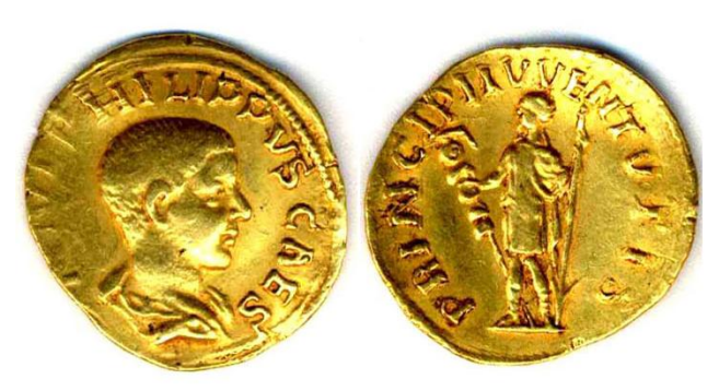
Aureus, 244-246, 3,85g, 20mm, Die-axis: 0h Cabinet des Médailles, Paris, Rothschild 467