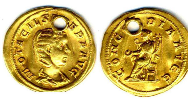
Aureus, 246-248, 4,58g, 21mm, Die-axis: 0h Cabinet des Médailles, Paris, FG1295, pierced