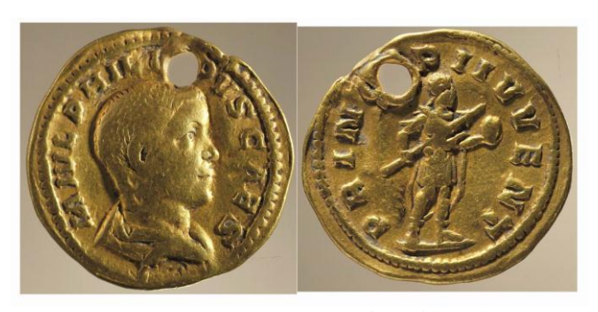
Aureus, 244-246, 4,90g, 22mm, Die-axis: 12h Musei Capitolini, Rome, No. 4548, Stanzani Collection