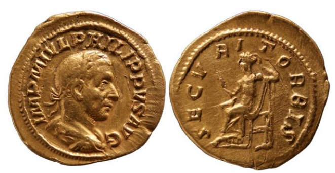
Aureus, 244-247, 4,50g, 21,3mm, 8h Vienna Münzkabinett, RÖ 38.629, from Graf Westphalen collection