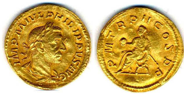
Aureus, 245, 4,02g, 20mm, Die-axis: 0h Cabinet des Médailles, Paris, FG1293