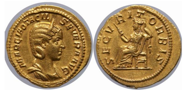
Aureus, 244-246, 4.51g, Die-axis: 7h Vienna Münzkabinett, Reg. No: RÖ 36.989 Purchased from the Bachofen-collection, it's no. 2019 in the auction catalogue from 1903