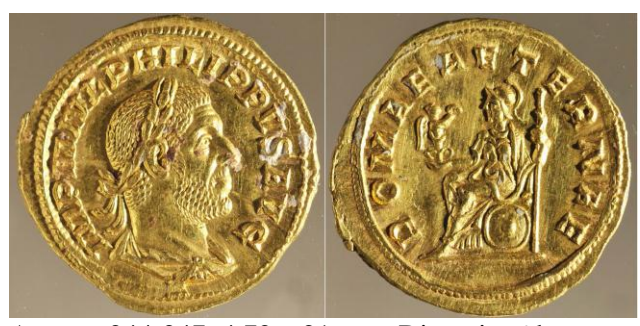
Aureus, 244-247, 4.72g, 21 mm, Die-axis: 6 h Musei Capitolini, Rome, No. 4472