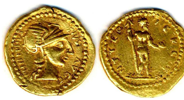
Barbarous medal, Antioch, Syria 244-249, 11,72g, 23mm, Die-axis: 11h Cabinet des Médailles, Paris