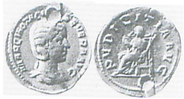
Aureus, 244-246, 4.24 grams, pierced Auction Ciani-Vinchon, 6-7<sup>th</sup> May 1955, Lot 389