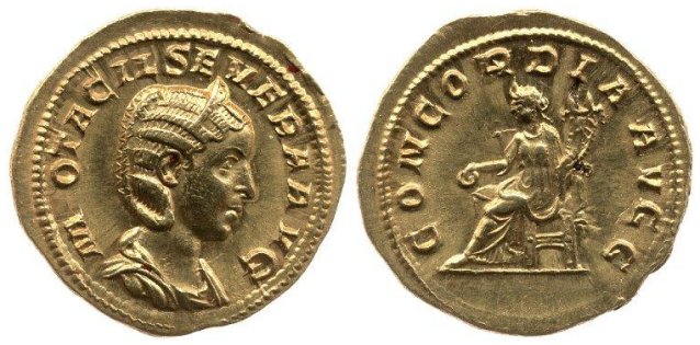
Aureus, 246-248, 4.68g, Die-axis: 7h British Museum, Reg. No: B.10299 Bequeathed by Clayton Mordaunt Cracherode in 1799