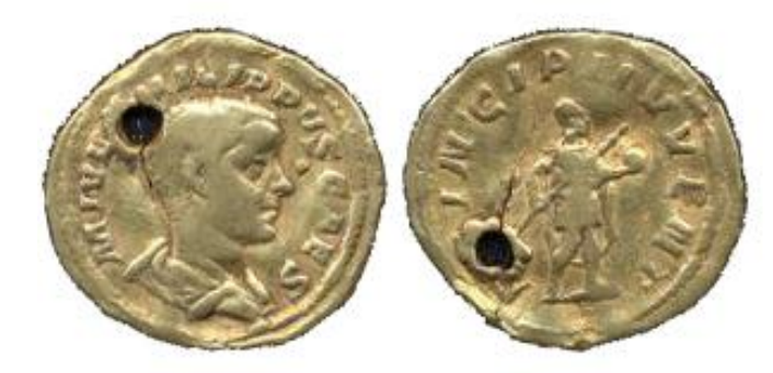
Aureus, 244-246, 4.94g, 21 mm, Die-axis: 6h Hunterian Coll.: Catalogue no. 29858