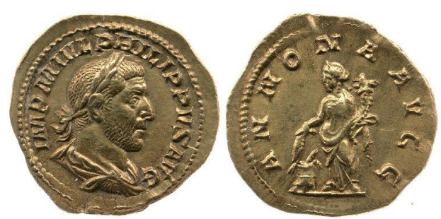
Aureus, 244-247, 4.35g, Die-axis: 6h British Museum, Reg. No: R1874,0715.96 Purchased from Rollin & Feuardent in 1874