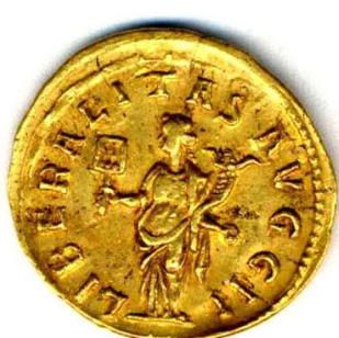
Aureus, 244-247, 4,50g, 20mm, Die-axis: 0h Cabinet des Médailles, Paris, FG1291